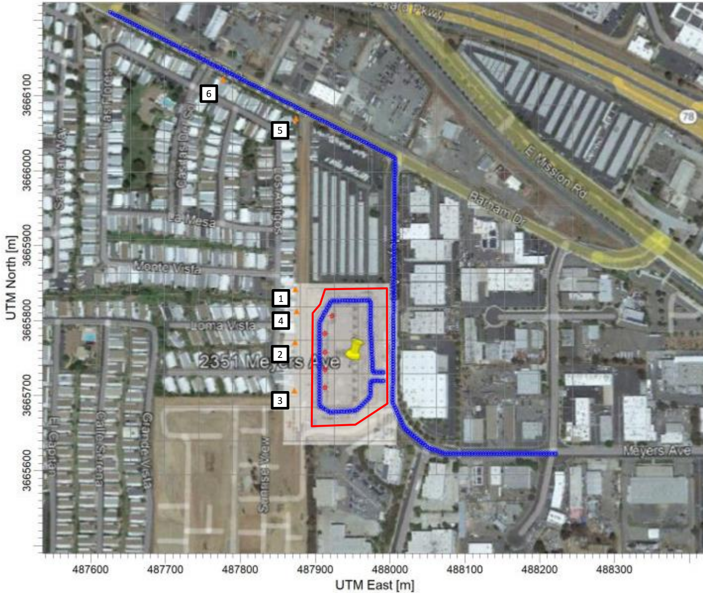
Exhibit A AERMOD Model Source and Receptor Placement